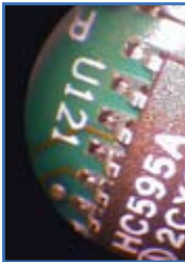
Components on a printed circuit board