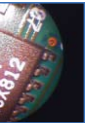
Printed circuit board