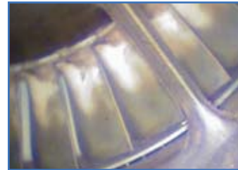
LPT blades in a turbine engine

The ELSV-60 offers a video channel for simple camera setup and operation. An intuitive single cable connection provides power to the camera and carries the signal from the camera back to the light source. Video outputs on the front panel provide the signal to a monitor or video recording device via composite and/or S-VHS connectors.