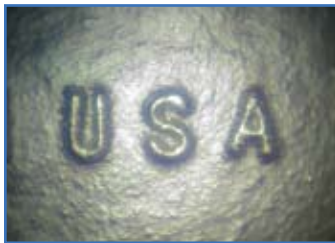
Bright illumination even on black castings